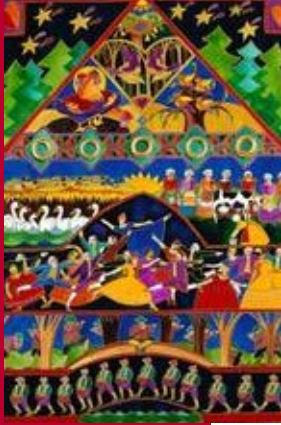
Twelve Days of Christmas

Ever wonder how much it would actually cost to buy the 12 Days of Christmas? Now is an excellent time to put your students' math skills to the test. Have your students research online the cost of each of the items for the 12 days. (Keep in mind you may not want your students to search the cost of a dancing lady – you may want to have a few of them ahead of time.) You can decide if they need to also factor in the cost of the activity. (ie: